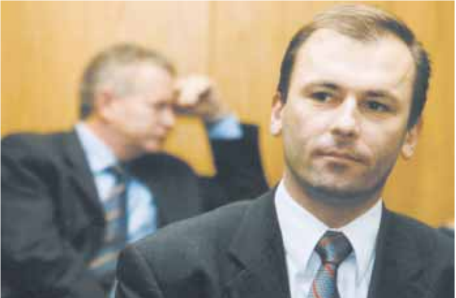
L. Kaník and in the background J. Migaš, former Speaker of the National Council of the Slovak Republic

Let us think about it and let us try to give an honest answer: If the Economic Club members and prominents of the Slovak economy do not demonstrate a will to change the quality of morals in business in Slovakia, who will do it? Or, put differently, who will do it for them?