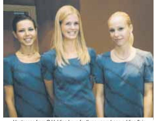
Hostesses from Q Holding have for three years been adding flair to the Economic Club meetings

changes be related to? First of all overtime which we consider too restricting and too short even within Europe. It will be related to the balance of the position of employee and employer. In my opinion the position of the employer today is at a major disadvantage vis-a-vis the employees, and the change will be related above all to making the mechanism of dismissing more liberal, which will at the same time mean making the mechanism of recruiting simpler. Another area is the position of trade unions in the individual companies, which to us seems inadequate. We are interested in aligning our legislation with the