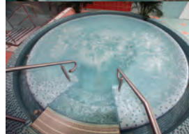
Location Turčianske Teplice