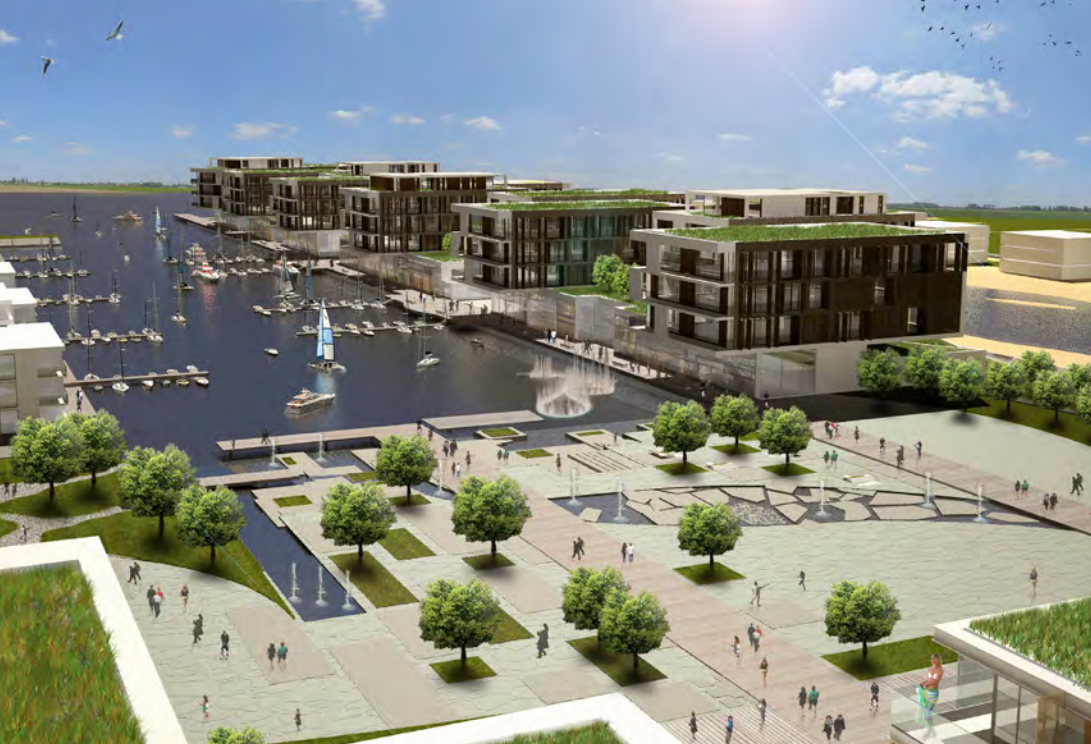
Danubia Park & Resort