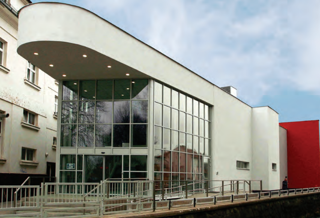
Wellness Turčianske Teplice