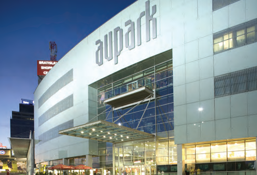
2002 Stavba roka - Aupark Shopping Center, Award of "Ministry of Construction and Regional Development of the Slovak Republic" for the best constructed building detail 2001 Special Architectural Award for Interior Design