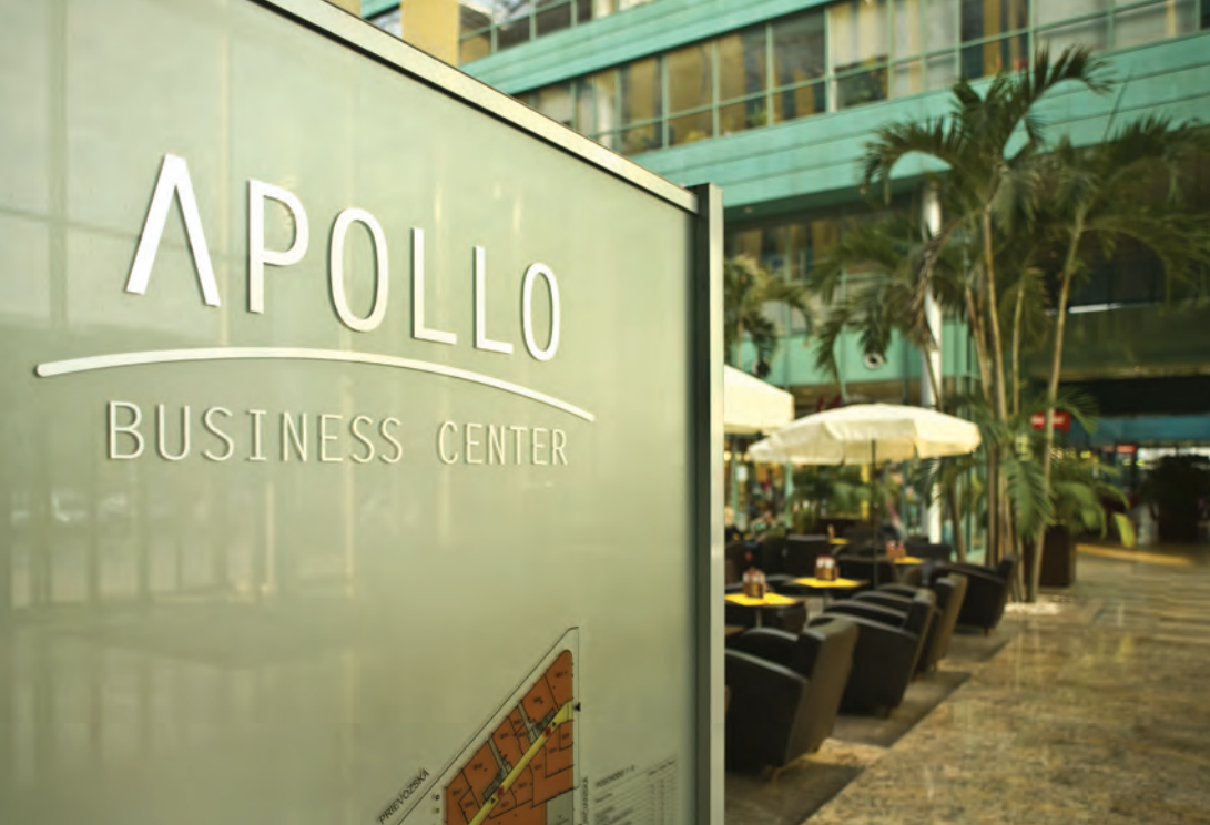
Apollo Business Center I, II