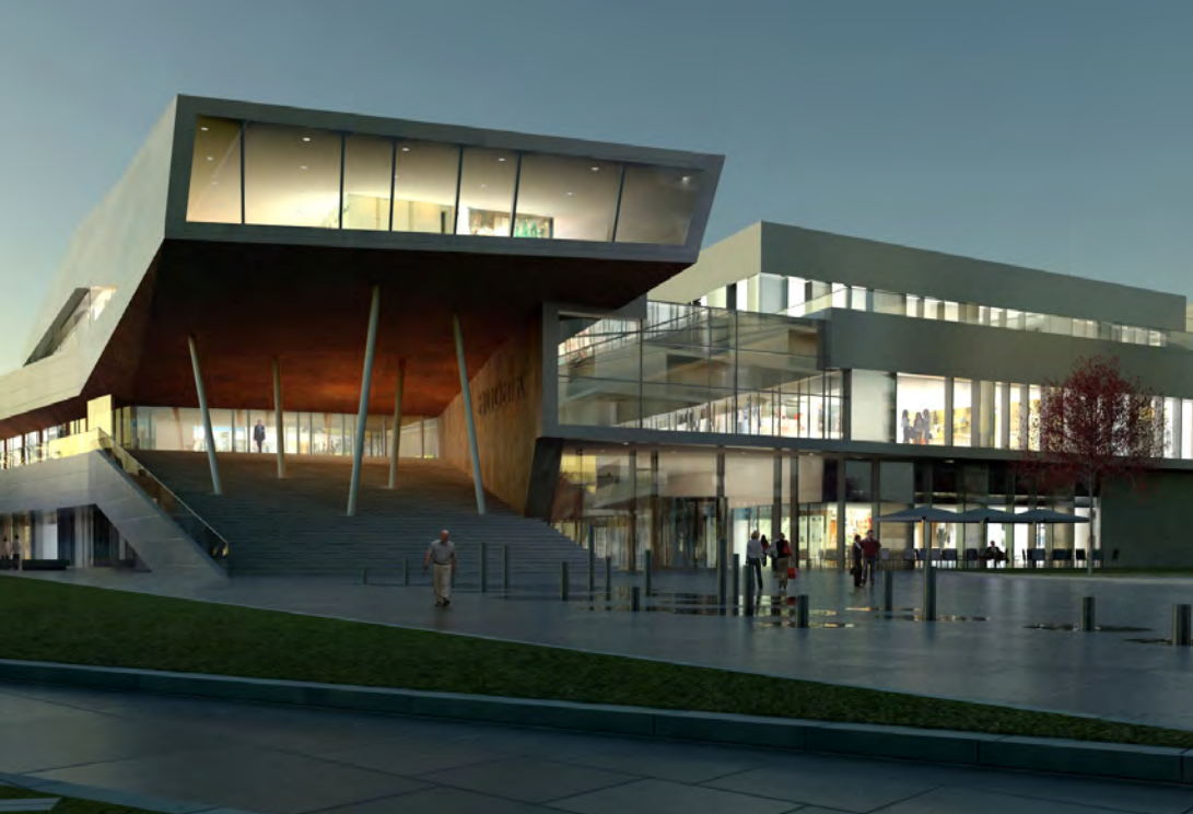
Ostrava Černá Louka