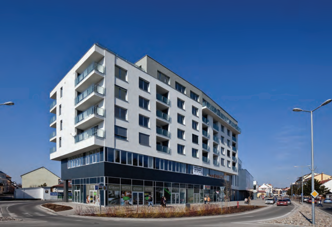
Polyfunkčný dom Piešťany